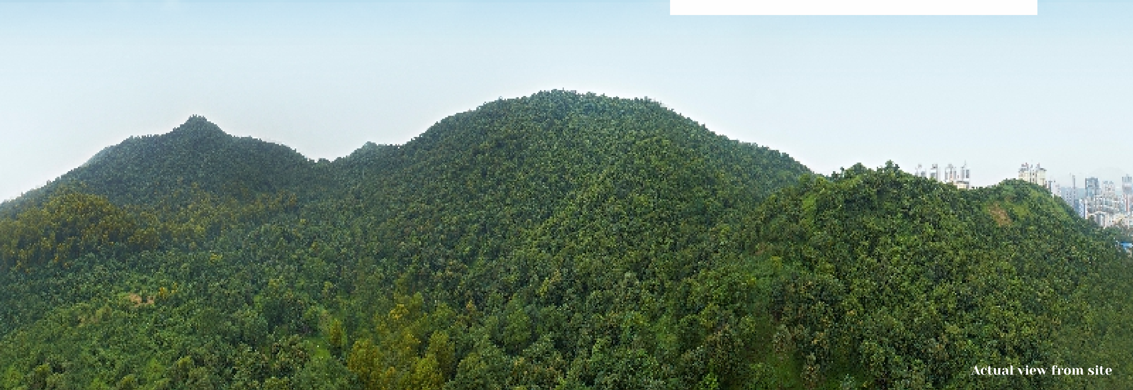
Actual view from site