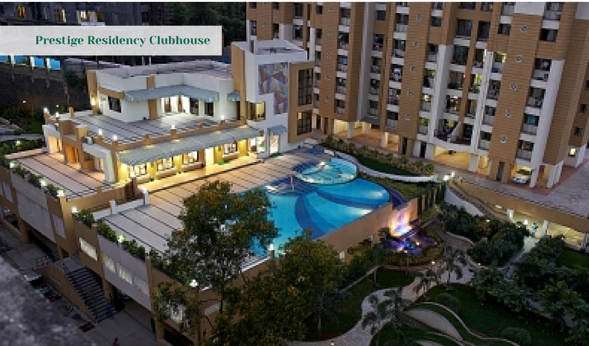
Prestige Residency Clubhouse