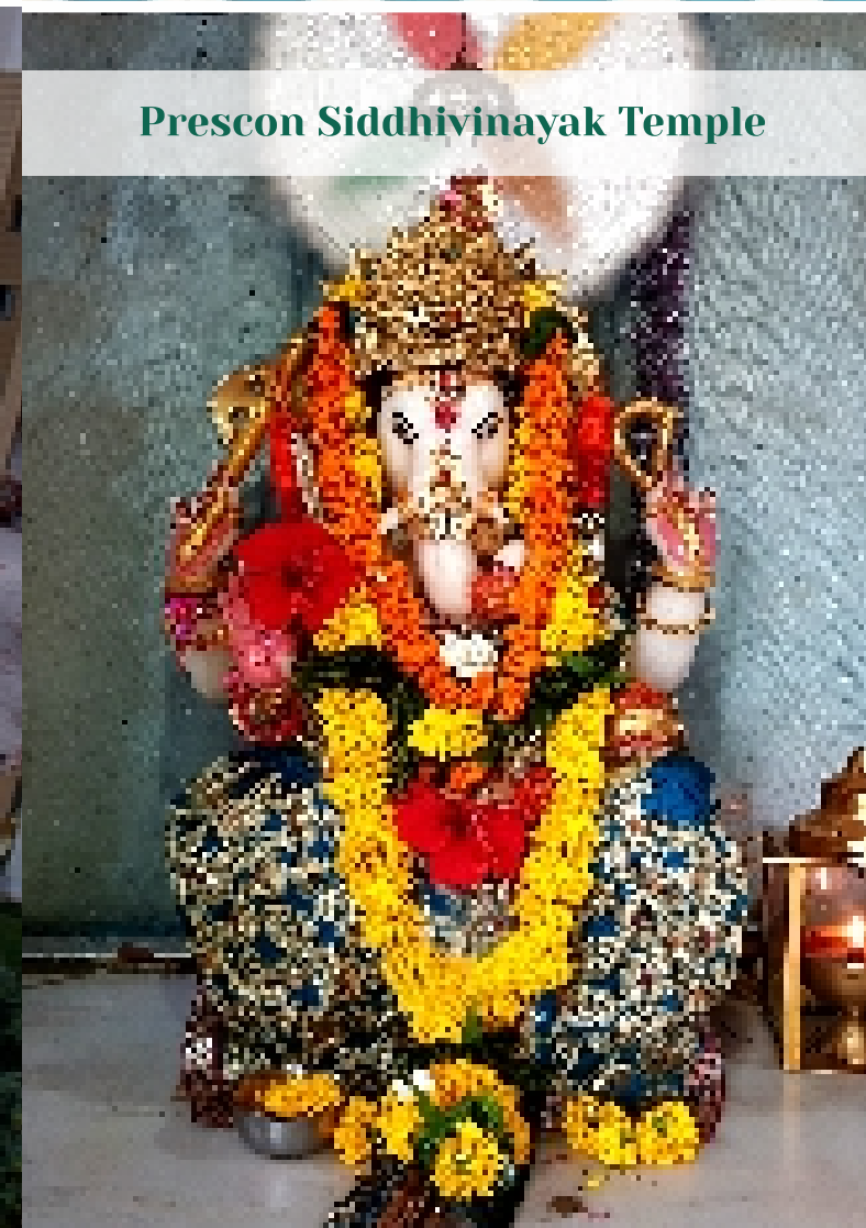
Prescon Siddhivinayak Temple